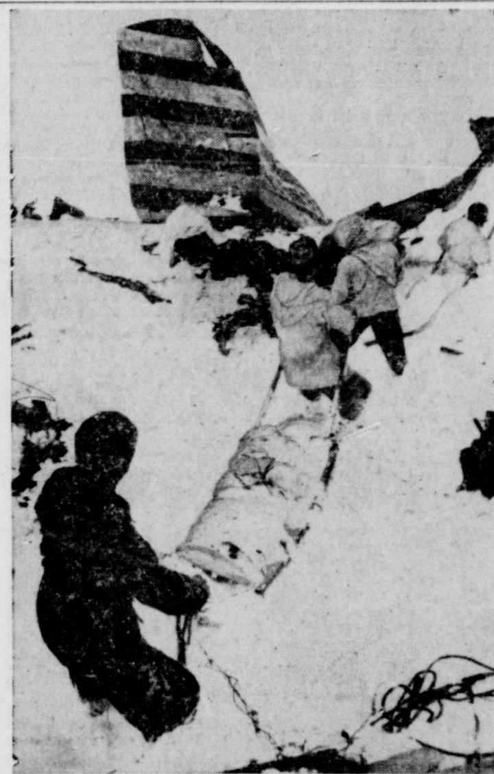
LOST IN A CRASH—Rescuers, working under danger of avalanches near Wengernalp, Switzerland, are recovering bodies from the Air Force C-47 which crashed on a glacier high in the Swiss Alps. The Air Force said the plane carried six officers and two enlisted men, but only four bodies had been recovered before the rescuers were forced to temporarily halt operations because of adverse conditions and threatening weather.

All members of the post have been asked to attend.