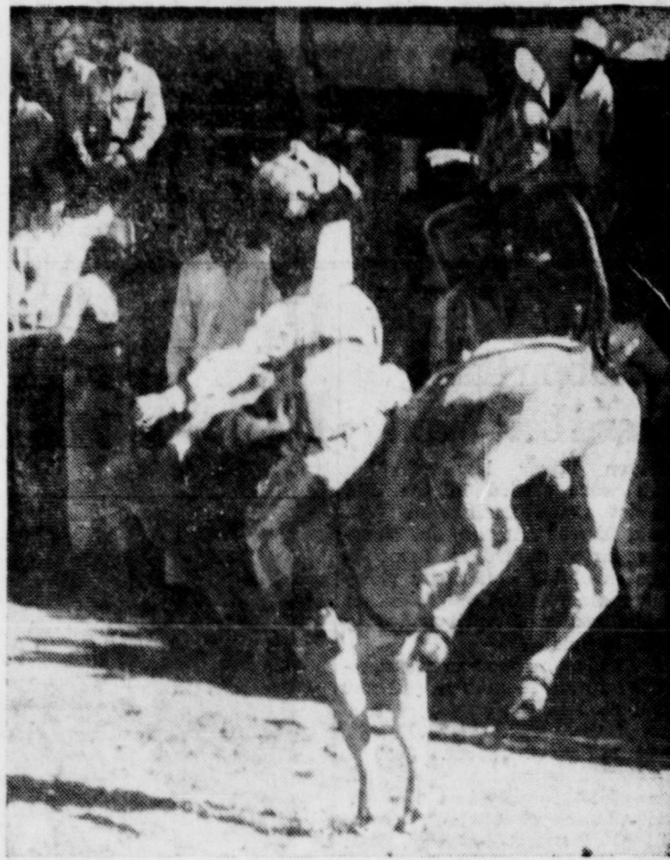
YOU CAN BET this wild brahma bull didn't learn that Conga twist at Arthur Murray's. It's only one of the many cute tricks these playful critters use to get rid of their convict riders at Texas' Annual Prison Rodeo. The big event takes place this year on Sunday afternoons, October 5, 12, 19 and 26.