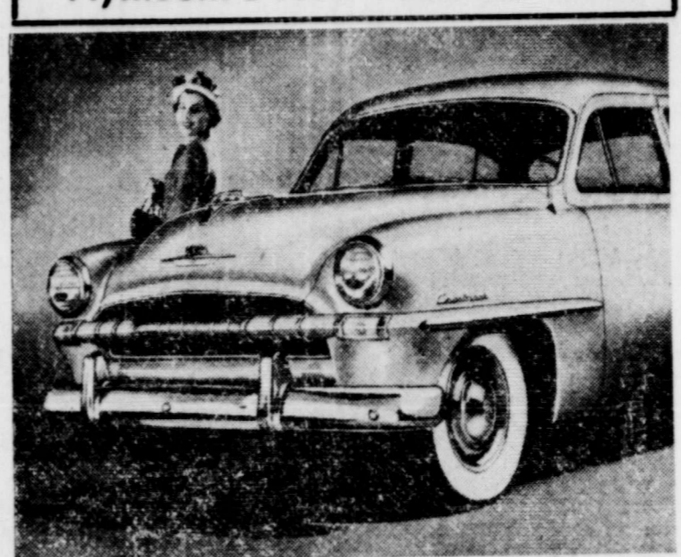
The distinctive grille of the 1953 Plymouth keynotes the new styling which carries through from bumper to bumper. The new models feature horizontal character lines that accentuate the ground-hugging grace of the new streamlined styling. The softly rounded hood, sweeping out to the fenders, covers Plymouth's improved 190-horsepower engine with its 7:1 to 1 compression ratio. Note also the one-piece windshield with uniform curvature for minimum distortion and "Control Tower" visibility. It is available also in restful, heat-absorbent Solex tinted glass.