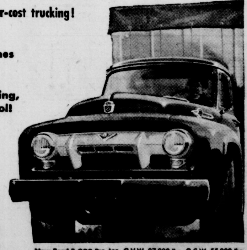
New Ford F-900 Box Van, G.V.W. 27,000 lbs., G.C.W. 55,000 lbs.