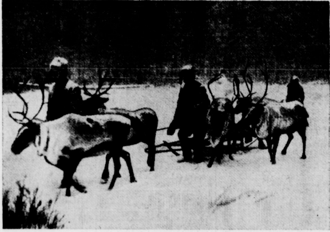
FOR HUNTING—The fur-hunting season is at its height in the Yakut Autonomous Soviet Socialist Republic.

THE future looks right good for the Sandler Manufacturing Company.