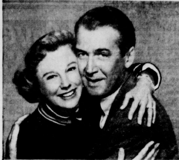
Pictured above are James Stewart and June Allyson, co-stars in "The Glenn Miller Story" which opens at the Palace Theatre Saturday night. The story tells of the life of the musician and his wife, portrayed by Stewart and Miss Allison. The picture is being shown for the first time in Eastland County at the Palace here. The show opens Saturday night and will continue through the following Thursday.