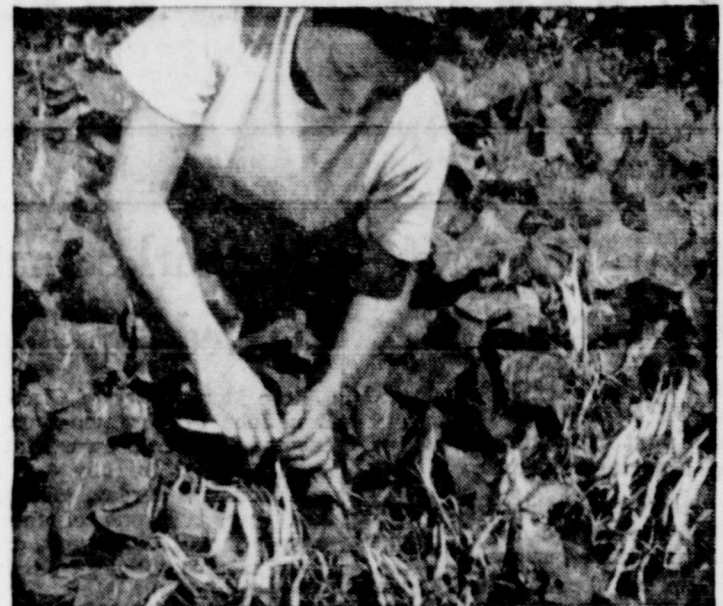
If You Cannot Use All the Beans You Harvest, Put Them Up for Winter.

Next to tomatoes, beans are the most popular of home garden vegetables, and one of the most efficient producers of food, for the space devoted to them.