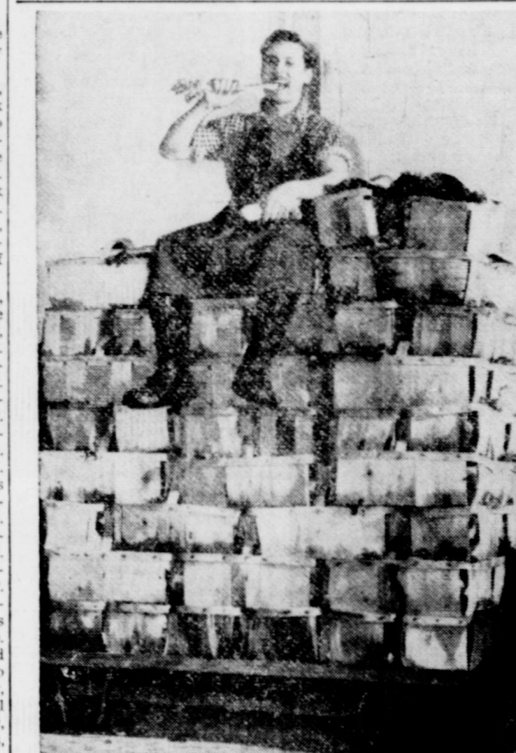
FAST WORKER—Peter Randazzo, 25, of Cleveland, may be the world's fastest celery wrapper. That pile of celery-filled baskets—there are 100 of them—his sitting on represents just 25 minutes of work for him. Randazzo's co-workers claim he's faster than a machine which might do the same work.