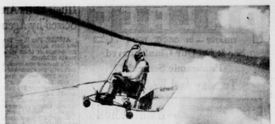
HOME MADE—This Gyro-glider weighs only 86 pounds and flies as slowly as 20 m.p.h. behind a towing vehicle in Raleigh, N. C. Made of lumber-yard and hardware store items, the $100 craft will glide or autorotate to the ground, landing at seven miles per hour.