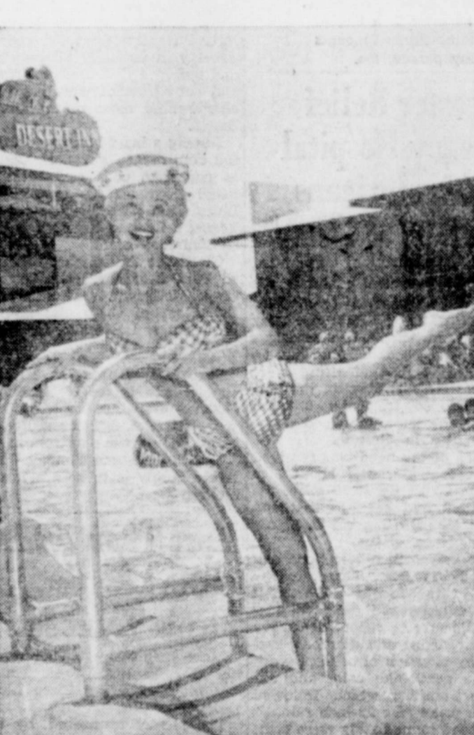
HERE SHE IS!—Jane Powell, the sweet singer of sweet songs, was getting a bit of physical exercise at a swimming pool in Las Vegas, Nev., while giving her vocal cords a rest. Jane was singing for her supper, and for the customers' pleasure, at one of the local hotels in the gay resort town.