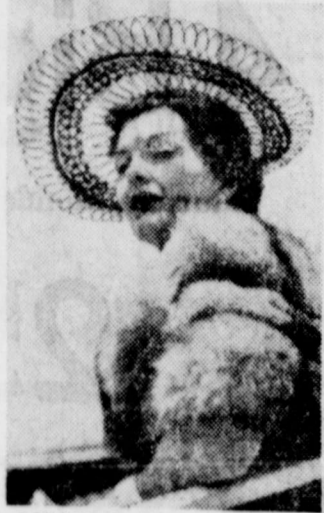
FILTERING IN - The sun, reaching through a lacy pattern of black braid casts attractive shadows on the face of the model wearing this striking bonnet. The pattern resembles the ovals in a child's penmanship book and works out from a black velvet crown.