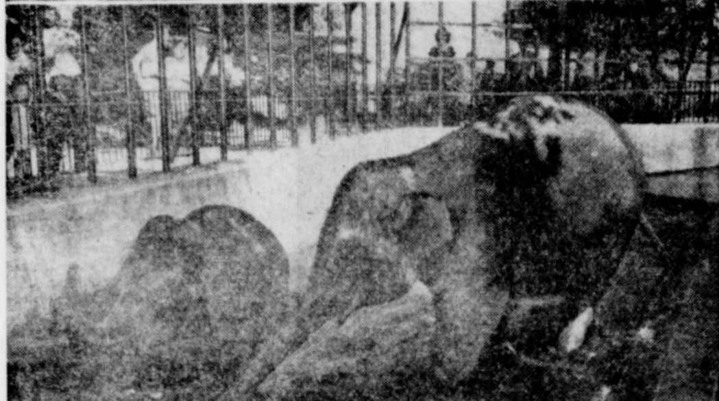
DIFFERENT LIVES—Elephants do not live the same all over the world. One of the big beasts with ivory tusks is aiding in the construction of a new harbor in Colombo, Ceylon, top photo, where the elephant is a work animal. But two other pachyderms are shown below in the shady end of their private pool in New York's Central Park. The hardest work they'll ever do is extend their trunks to visitors to beg for a handout.