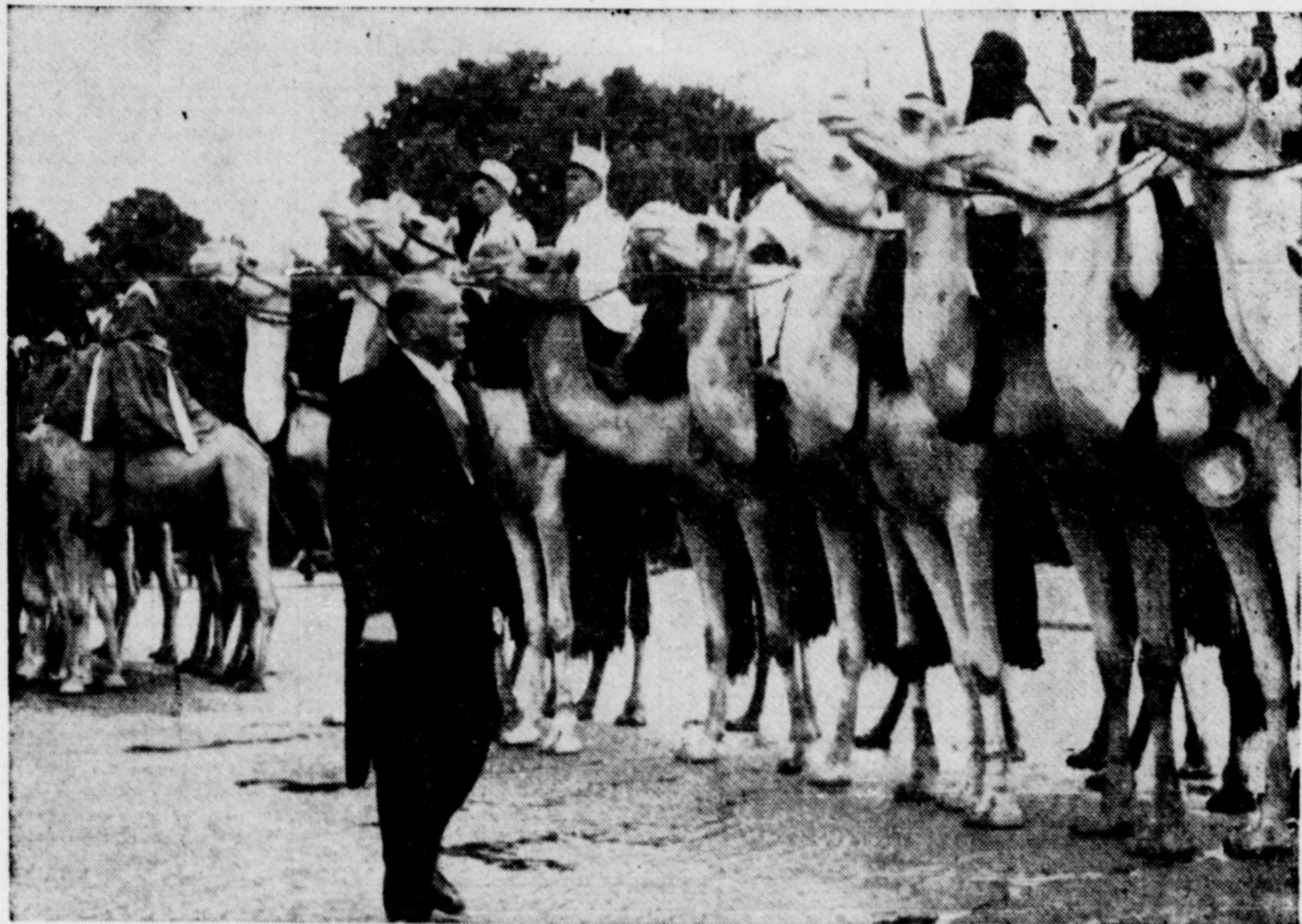
OUT OF THE ORDINARY—President Rene Coty of France is shown dressed in white tie and tails as he inspects a line of knobby-kneed camels, mounted by the Meharist Brigade in Paris. The famed desert soldiers and their receding-chinned mounts were in the French capital for the annual Army Nights celebration. They took part in the Bastille Day parade, too.

ON THE MARCH—A mama mallard is leading her newly-hatched brood in their first personal appearance in Chicago. The babies were born at the city's Natural History Museum and their mother is mighty proud of them — with every reason; there's not an ugly duckling in the lot.