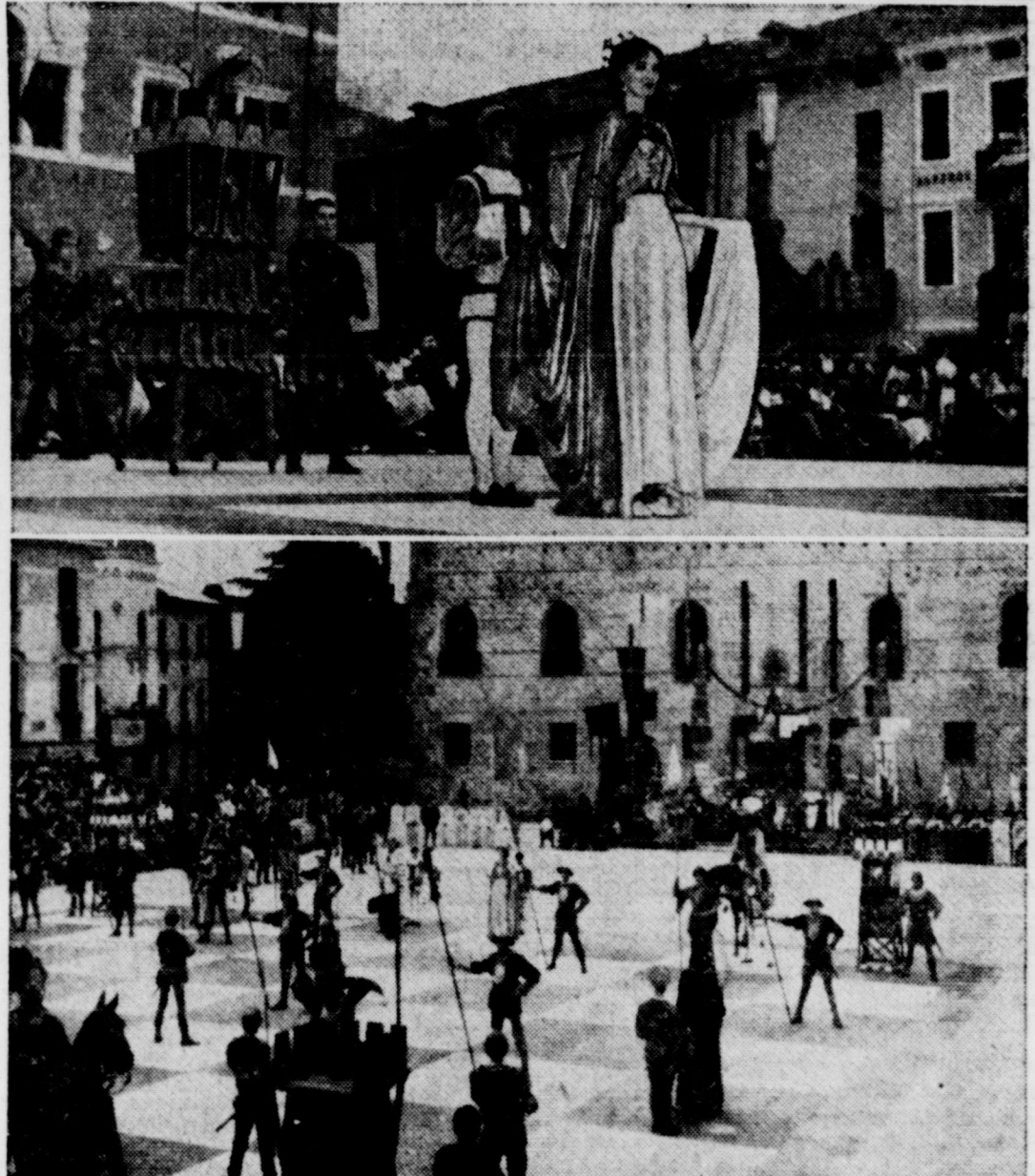
HUMAN PAWNS—A chess tournament in Vicenza, Italy, used human pawns, bishops, and knights in reviving an ancient pageant.