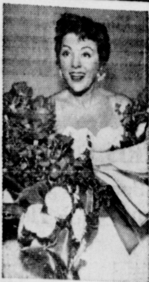
TRIBUTE —After her opening at a Hollywood night club, singer Lillian Roth was deluged with flowers, telegrams and applause. She'll act as technical advisor when Susan Hayward stars in the movie of Lillian's best-selling autobiography, "I'll Cry Tomorrow."