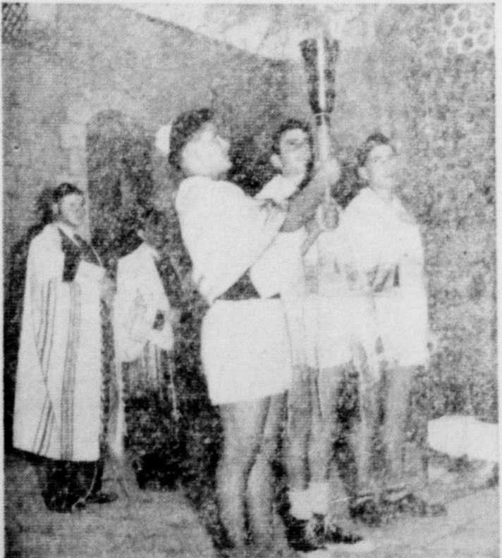
FREEDOM TORCH—A young Maccabee honor guard is preparing to run a lighted torch from Mt. Zion in Jerusalem to Modin, site of the Maccabee rebellion, in celebration of Chanukah, the Jewish festival of freedom. The torch was later flown to the U.S. for use in a Chanukah Festival in New York.

Eastland, (Abstracting since 1923) Texas