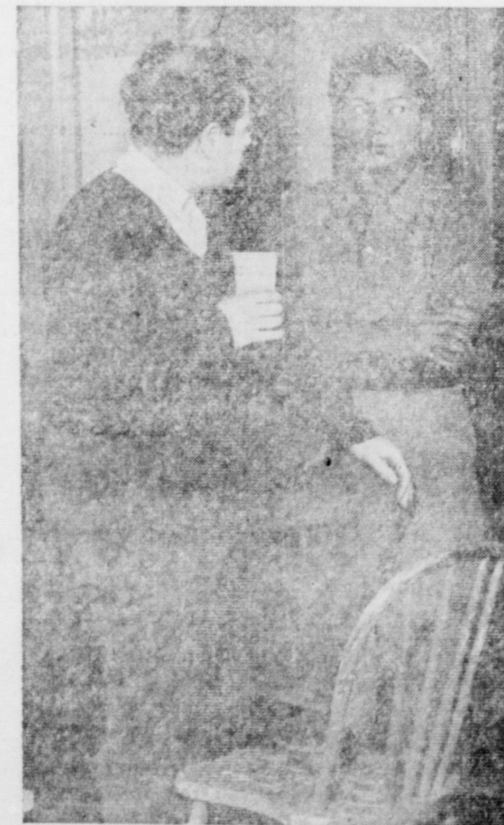
FIVE MINUTE BREAK—Director Peter Brook and singing star Pearl Bailey had something thoughtful to discuss in Philadelphia where Miss Bailey is appearing in "The House of Flowers." The new musical show was trying out in the City of Brotherly Love before its Broadway opening.