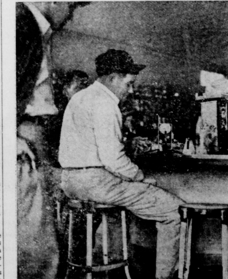
COUNTER ON A COUNTER—A uranium prospector in Oswego, Kans., uses his geiger counter to get a reading on some ore samples he obtained there. Like any of the mining towns of bygone days, prospectors examine their harvest in settings such as the restaurant shown here. A uranium content has been indicated by the counters in the Oswego area.