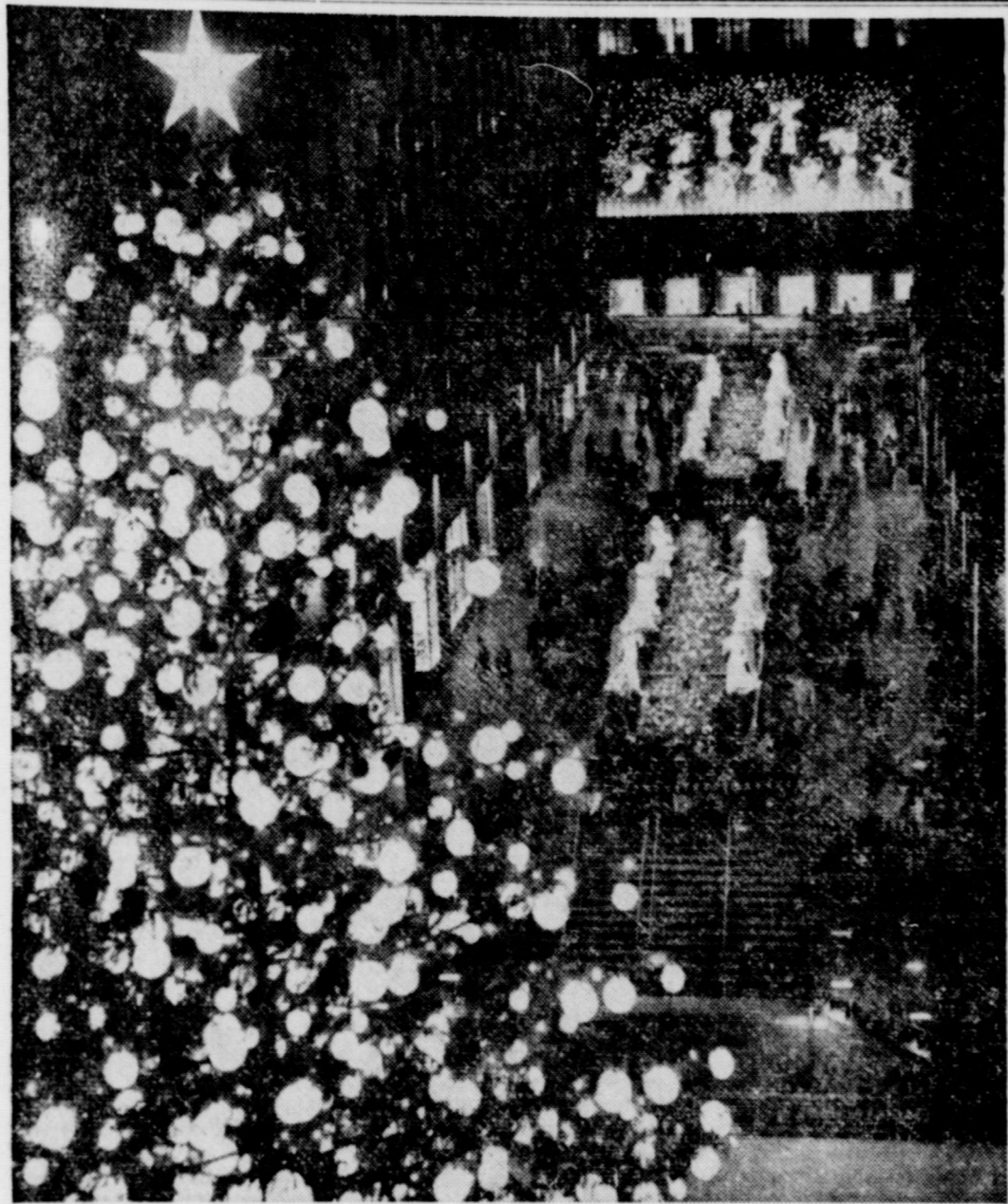
IN ALL ITS GLORY—One of Manhattan's annual "musts" is a good look at the Rockefeller Center Christmas decorations. The 65-foot tree, which weighs four tons, is decorated with 2000 "firefly" bulbs and 1800 green, red and yellow plastic globes. The "angel" decorations, extending to Fifth Avenue in the background, have attracted bigger crowds than ever before.