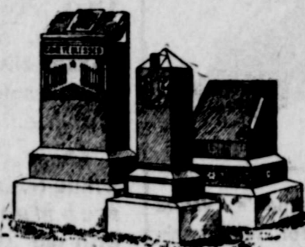
TOMBSTONES MADE IN ANY DESIGN, ALMOST ANY PRICE