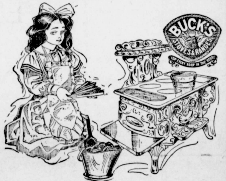
GIRLS' STOVE CUT.

This saddle will be given to the girl who gets us up the largest amount of Cash Register Checks.