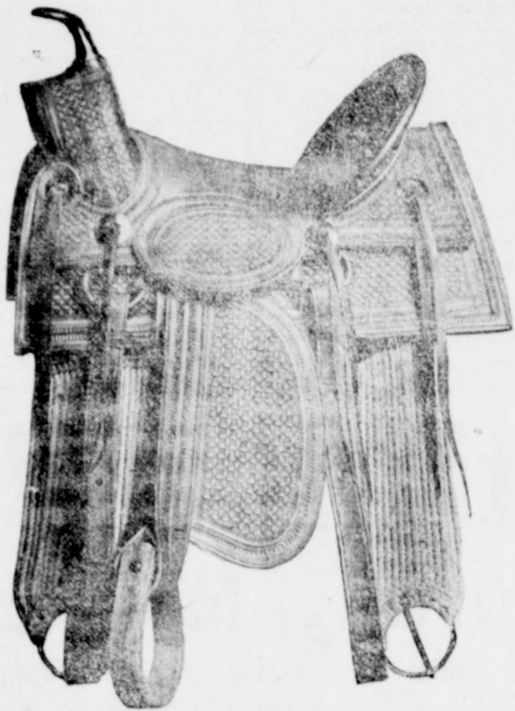
BOYS' SADDLE CUT

Premiums to be given away to boys and girls for Cash Register Checks. This makes the largest and most valuable list of presents we have ever given away and as they are absolutely free for Cash Register Checks they are worthy of your inspection and can be seen in the show windows at our Furniture Store, and you are invited to call and see them. They are as follows: