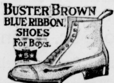
BUSTER BROWN SHOE CUT.

We will give three Single Barrel 16-gauge Shot Guns to the three Boys who get us up the fourth, fifth and sixth largest amount of Cash Register Checks.