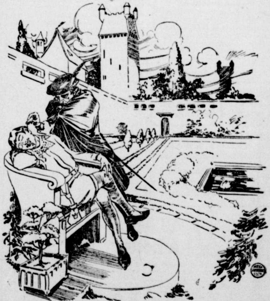
POISONING A KING

A KING OF DENMARK was murdered by one of his subjects pouring poison in his ear and then seizing the throne. This method of acquiring power is frequently resorted to by modern politicians who are able to succeed only by pouring poison in the ears of the people and seizing authority. No government can long survive incompetent and inexperienced management. We must place in position of power men whose hands have held the plow and the hammer, whose hearts have felt the glow of industry and whose vision can sweep the horizon of twentieth century civilization.