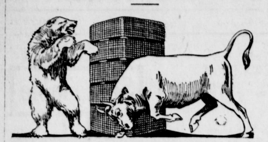
ANNUAL VALUE OF TEXAS COTTON CROP $220,000,000.

Cotton is the most profitable crop known in agriculture and it is one of the most useful and powerful of American industries. Millions cultivate the plant, as many more weave at its looms and its fibre clothes mankind. The plant yields the Texas producers a million dollars per day; its harvest moves the world's currency across the continent and, when marketed, the bulls and bears of two hemispheres tear at it until one or the other falls with a crash that can be heard around the world.