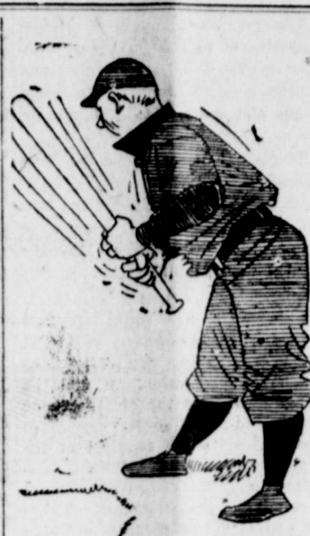
Had All the Pitchers "Buffaloed."