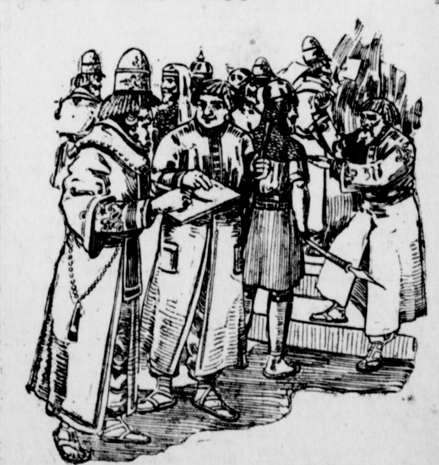
CONDEMNING ARISTIDES THE JUST.

The soul of state is in its people and a narrow, jealous and envious citizenship results in bigoted, revengeful and dangerous leaders and a weak and tottering government.