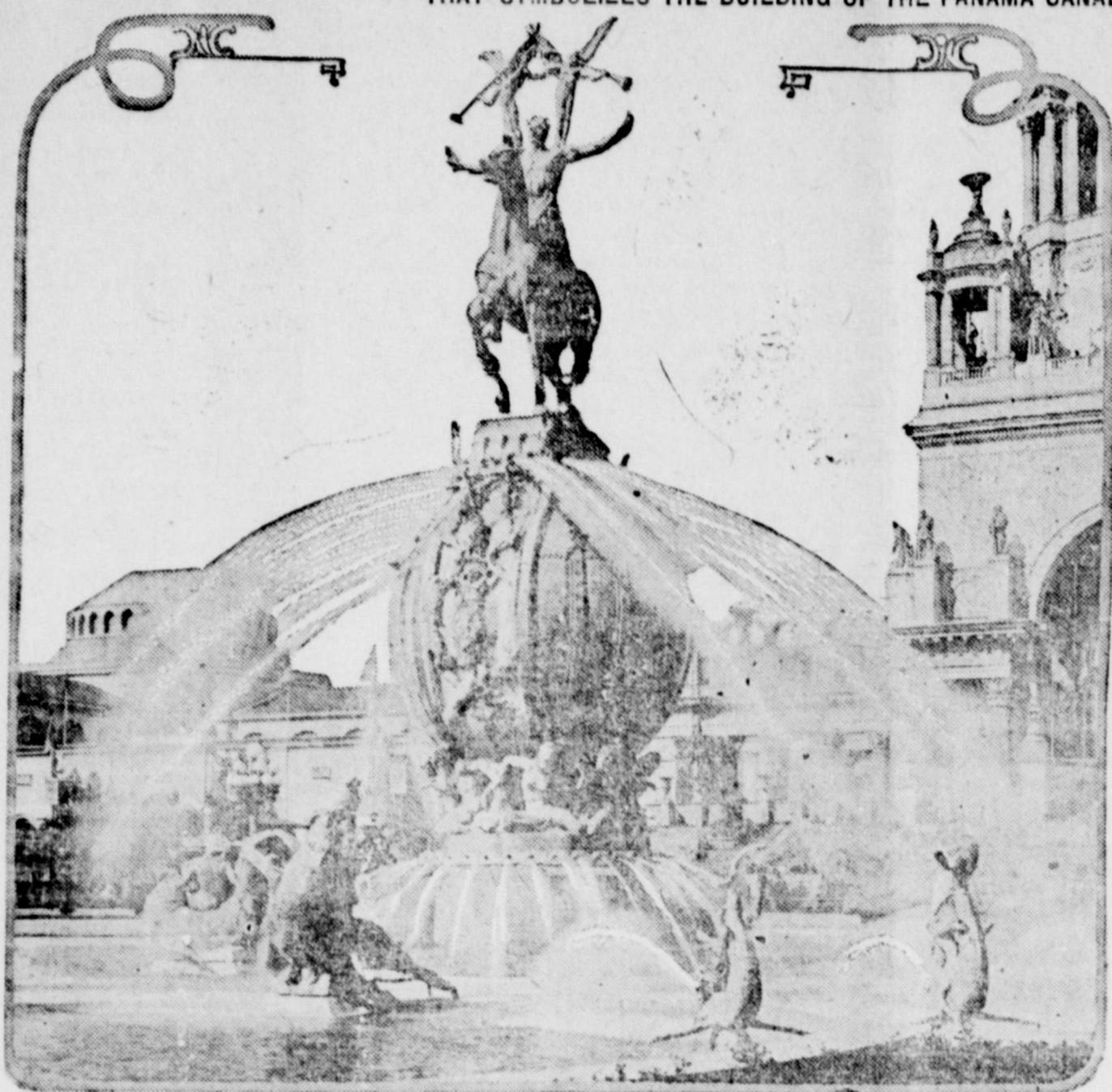
The labor that went into the building of the Panama canal is symbolized in the Fountain of Energy, by A. Stirling Calder. This heroic sculpture stands in the center lagoon of the three lagoons of the South Gardens and faces the main entrance gates. The waters were first released on opening day, February 20, coincidentally with the opening of the portals of the exhibit palaces and by the same means: the electric spark transmitted across the continent when President Woodrow Wilson opened the great exposition at San Francisco by wireless.