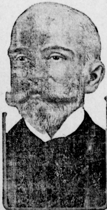
Bernardino Machado, recently elected president of the Republic of Portugal, has been prominent for years in the public life of that country, holding many offices. He was minister to Washington in 1900 and 1907, under the name of Marquis de Santo Thyrso, a papal title, which he afterwards dropped.