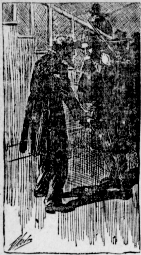
"You Damn Coward! What Did You Tell?"

ain't gone fur in this storm. Enyhow thar's one thing sure—they ain't a hidin' up yere. Cum on, boys, let's take a 'nother look 'round down below."