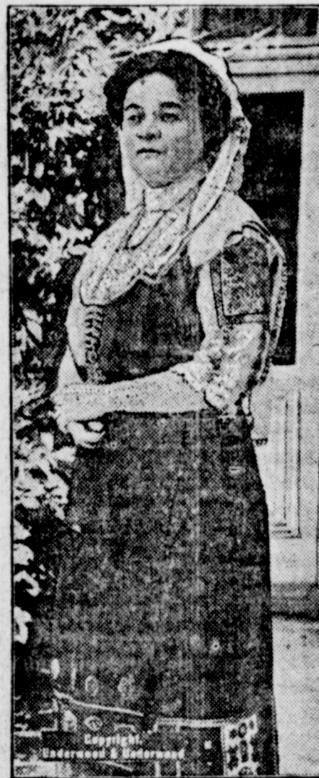
The most recent photograph of Eleanore, queen of Bulgaria, which was made on the porch outside the royal palace at Sophia, shows her wearing the simple native costume of her subjects. The queen before her marriage to the Bulgarian king was the Princess Eleanore of Reutz-Kostritz.