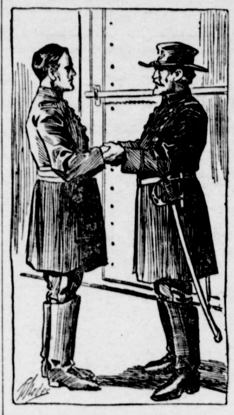
Fux Grasped My Hand Firmly In Both His Own.

I waited, motionless, holding my breath in fear that some eye might have witnessed the tearing of the paper; but there was no cessation of noise, no evidence of discovery. Assailed by a temptation to view the scene, I found foothold a little higher