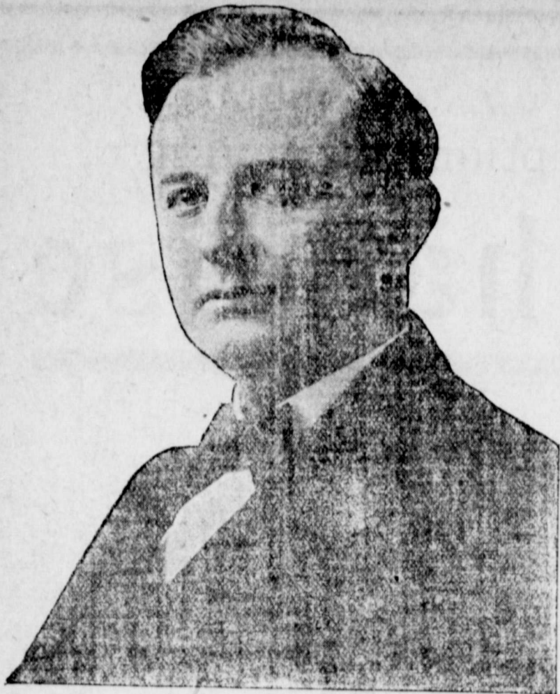
JAMES E. FERGUSON, Ex-Governor Soon-to-Be

Against whom articles of impeachment were preferred last Friday by the Texas House of Representatives, the vote being eighty-one to fifty-two. He has the honor (?) of being the first governor of Texas to be summoned before the Senate for trial. On Wednesday the State Senate convened as a court of impeachment for the fifth time in the history of the state, three judges and one land commissioner having in former years been tried by the senate. All of them were acquitted.