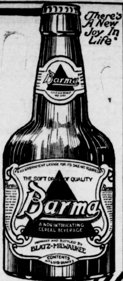
Look for the Orange Label, Red Triangle and the Name, BARMA, in White.