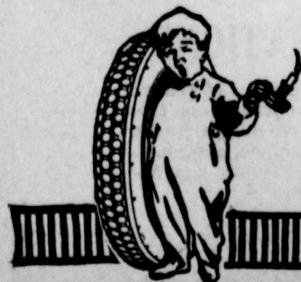
Time to Retire? (Buy Fisk)