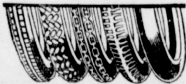
ROYAL CORD - NOBBY - CHAIN - USCO - PLAIN

In sandy or hilly country, wherever the going is apt to be heavy—The U. S. Nobby.