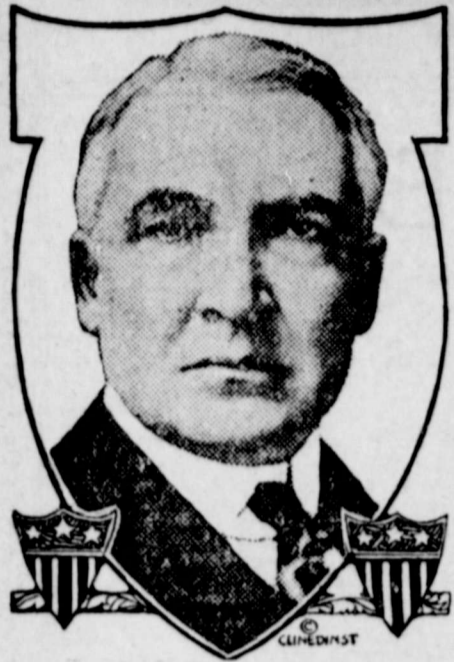
WARREN G. HARDING

Warren G. Harding has always been a resident of Ohio, which State he has represented as United States Senator since 1914. In private business life he is publisher of the Marion, Ohio Star.