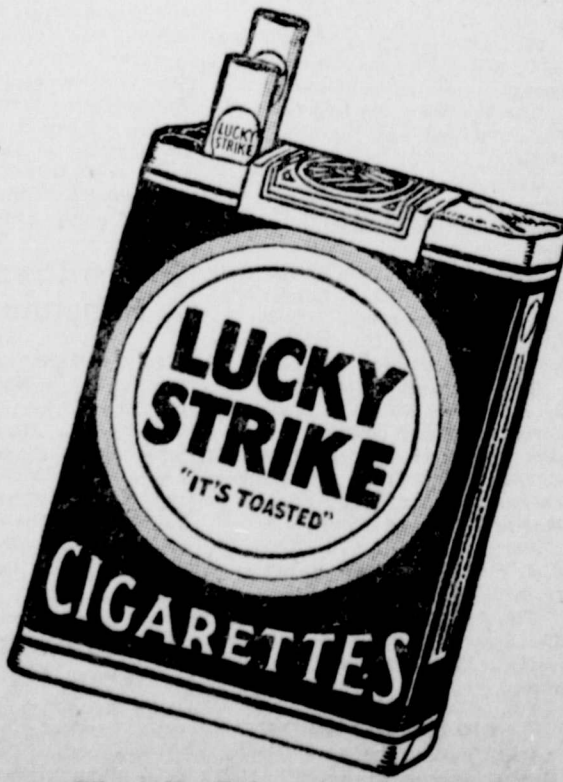
When in New York you are cordially invited to see how Lucky Strikes are made at our exhibit, corner Broadway and 45th Street.