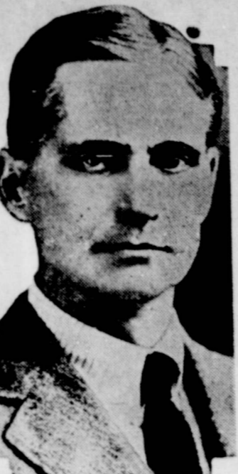
Robert Bass, former Governor of New Hampshire, is being considered by President Coolidge for the post of Ambassador to Cuba.

TYLER SHIP'S TEN CARLOADS OF EGGS. TYLER, June 27.—During the past four months ten carloads of eggs and a dozen carloads of poultry have been shipped from Tyler, involving expenditures of approximately $45,000. One large produce house, with offices here, is endeavoring to ship one car of eggs and a half a car of poultry weekly, and this company has frequent-