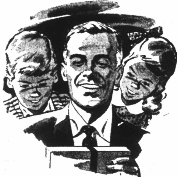
Gala Father's Day Gift Wrappings!

Choose now from Grammer-Murphey's sparkling new gift collections!