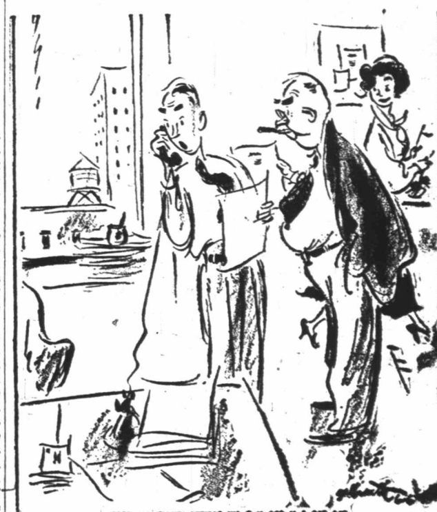
"But I can't sing to him now, even if he won't eat his strained spinach!"