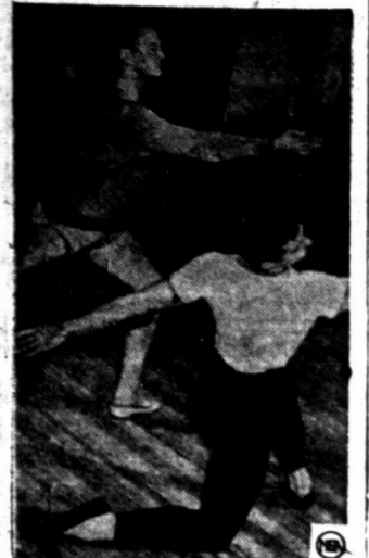
Dance: 3,000 vets took lessons, including school of ballet.

WASHINGTON—(NEA)—With the July 25th cut-off date at hand on GI education, the Veterans Administration estimates that American ex-servicemen will have ignored more than 80 per cent of all such benefits available to them.