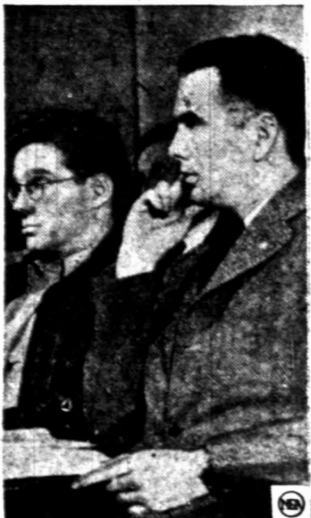
College: 2.2 million vets took U. S. financed courses.

It is not enough to make an application for training before the