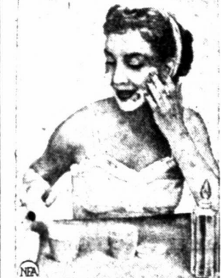
This young woman is assured of the freshness of new marrow cream, since each jar is date-controlled.

The ancients discovered the beneficial effects of bone marrow, and used it both internally and externally for improving health and