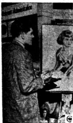
Art: This ex-GI and 40,000 others trained as artists.

For this huge sum 3.2 million vets got an average of a year and a half's schooling below college level, mostly in trade schools teaching auto and airplane mechanics; in addition, many completed high and grade school. The nation's col-