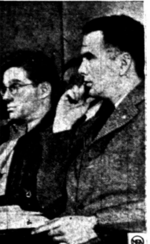
College: 2.2 million vets took U. S. financed courses.