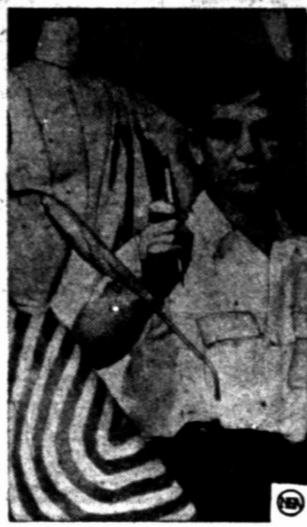
Fashion: Dress designing was among the studies vets chose.

must let the VA know, however, that he has applied for admission each year after completing their GI Bill preliminary training.