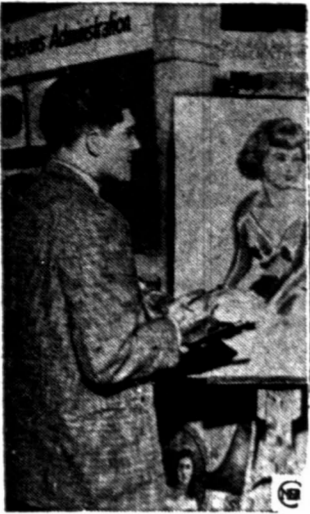
Art: This ex-GI and 40,000 others trained as artists.

For this huge sum 3.2 million vets got an average of a year and a half of schooling below college level, mostly in trade schools teaching auto and airplane mechanics; in addition, many completed high and grade school. The nation's col-