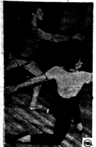
Dance: 1,000 vets took lessons, including school of ballet.

WASHINGTON—(NEA)—With the July 25th cut-off date at hand on GI education, the Veterans Administration estimates that American ex-servicemen will have ignored more than 80 per cent of all such benefits available to them. Out of 15.3 million veterans eligible for some free schooling on Uncle Sam, only 600,000 of them