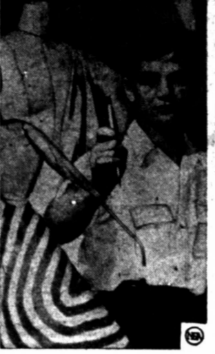
Fashion: Dress designing was among the studies vets chose.

Veterans who have completed pre- or pre-dental training, but who haven't been admitted to a professional school for completion of the course, aren't necessarily affected by the deadline. The veteran