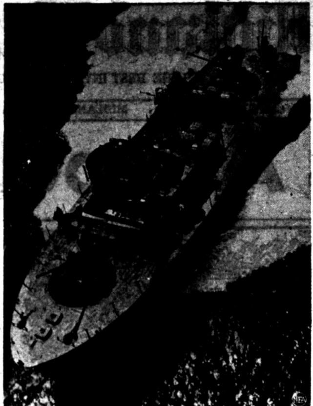
TOPSIDE OF THE NEW PT BOAT —Bristling with guns and with its crew at general quarters, the Navy's new PT boat, the 810, skims over the waters of Chesapeake Bay. This overhead view of the improved "Mosquito" boat shows its trim lines and its "king size," as compared to its World War II ancestors.

Plus: THREE CARTOONS Come early so the kiddies can play! Box Office Opens 6:30 p.m. — First Show at Dusk.