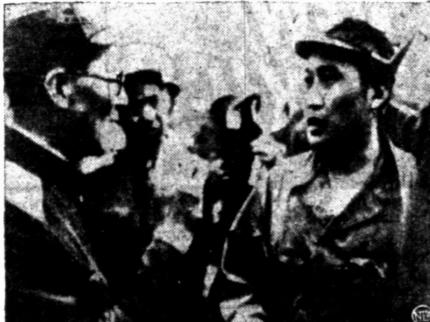
THEY SHALL NOT PASS—The commanding officer of a North Korean outpost, left, tells a U. S. Army interpreter their convey, including 20 UN newsmen, will not be allowed to proceed to Kaesong. After reporting to General Ridgway by radio, the convey was ordered to return to the UN camp.

INDIANAPOLIS—(P)—Total damages from an explosion and fire Thursday at the General Motors jet engine plant here were estimated Friday at $7,500,000, approximately 15 times the previous, unofficial calculation.