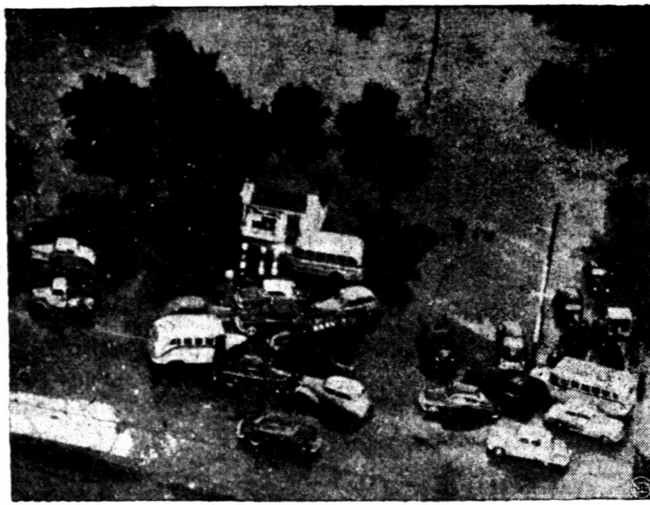
RECORD FLOODS HIT KANSAS—These autos are parked on one of the few stretches of Highway 50 between Strong City and Peabody as record flood waters spread over a wide area of Kansas. The Cottonwood River at this spot near Elm-dale, Kan., covers most of the highway.

CEDAR POINT, KAN.—(P)—Passengers on the deluxe train El Capitán, surrounded by flood waters since Wednesday, looked on Friday the thirteenth as rescue day. A convoy of six buses has been traveling a circuitous route over Kansas' flood-out roads in an attempt to reach the Santa Fe train. The buses were expected to get close enough to it Friday to permit the 337 passengers to be ferried aboard them. The travelers were in no immediate danger. The train was on a dry site about 120 miles southwest of Kansas City, but the tracks on both sides were high under water.