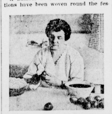
When Eggs Are Cool Rub With a Buttered Cloth.

tival of Easter. One old custom, that of Pace-egging, is still carried out in Germany and in parts of the eastern counties.