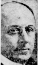
Atty. Gen. Cummings