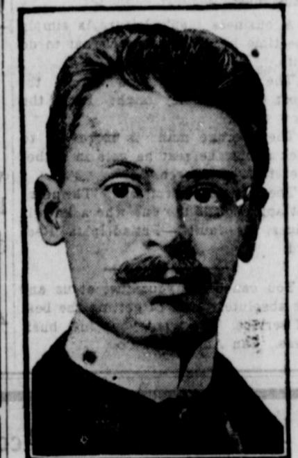
HIRAM P. MAXIM. Hiram Percy Maxim, inventor of the firearm attachment by means of which the report is silenced, is the son of Sir Hiram S. Maxim and the nephew of Hudson Maxim, the famous inventors.

Stuart's Charcoal Lozenges are for sale everywhere, 25 cents a box, guaranteed to contain nothing but young willow wood charcoal and pure honey; sample sent free upon request. Address F. A. Sauret Co., 260 Stuart Bldg., Marshall, Mich.