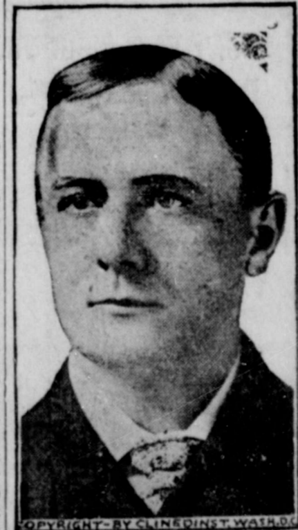
HARRY S. NEW. Harry S. New, Indiana's representative on the Republican national committee, is one of the most prominent residents of Indianapolis and was publisher of the Journal of that city for many years. Mr. New was born in Indianapolis, Dec. 31, 1858.