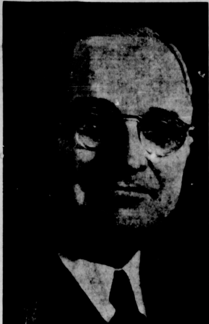
PRESIDENT HARRY S. TRUMAN