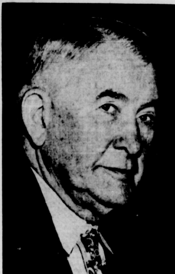
SENATOR ALBEN W. BARKLEY