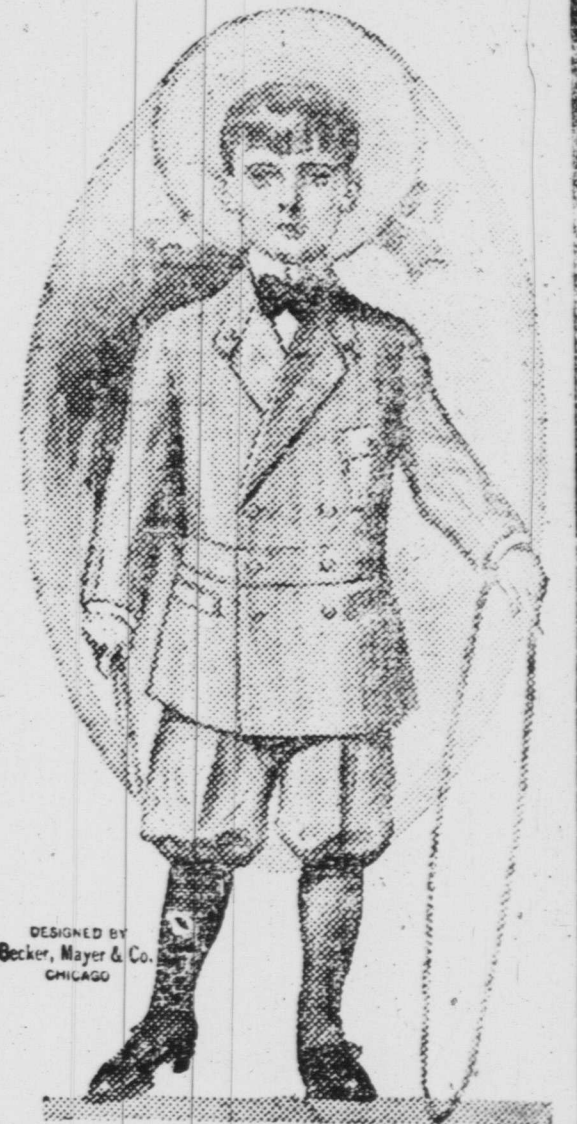
DESIGNED BY Becker, Mayer & Co. CHICAGO

Don't take our word for it. Come and see the goods and learn more about values than we could tell you in a big advertisement. We want your trade. We'll give such good value for every dollar you spend here that you'll find our garments the best in the world for the money.