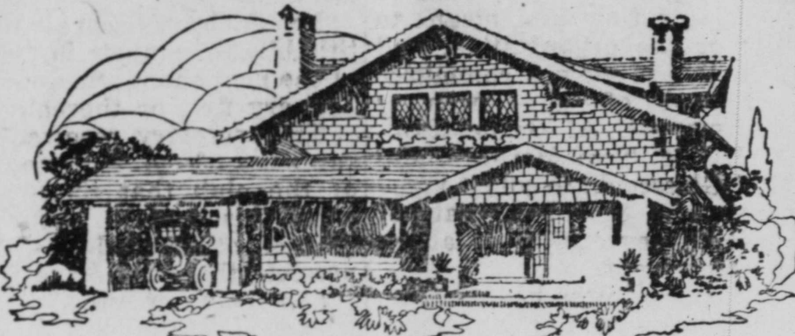
A NOVEL YET DIGNIFIED HOME.

Here is a home that combines novelty with dignity, a rare combination, yet you will agree with us that it is attractive, and commands attention, not from its freakishness, but from its home-like appearance. The predominating feature of the exterior are the wide and sweeping gable, and the stucco columns (both which relieve the usual lines of the average story and a half home.