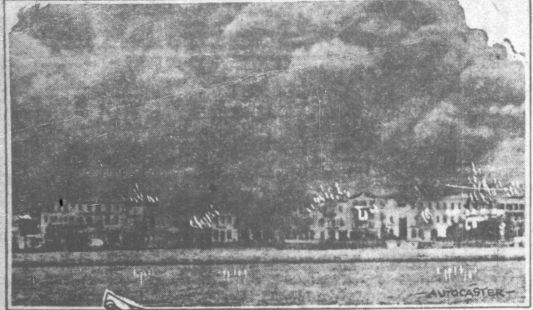
First picture to reach America showing Smyrna in flames from torches of the triumphant Turks under Kemal Pasha. Thousands are believed to have perished in the flames and from swords of the Turks.