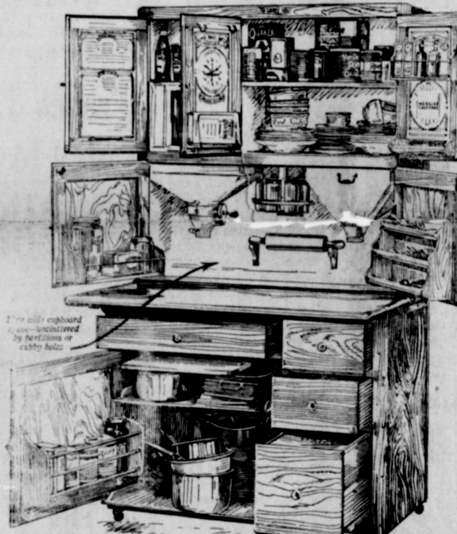
This is "HOOSIER BEAUTY" The National Step Saver

We have had a wonderful sale this week—These new