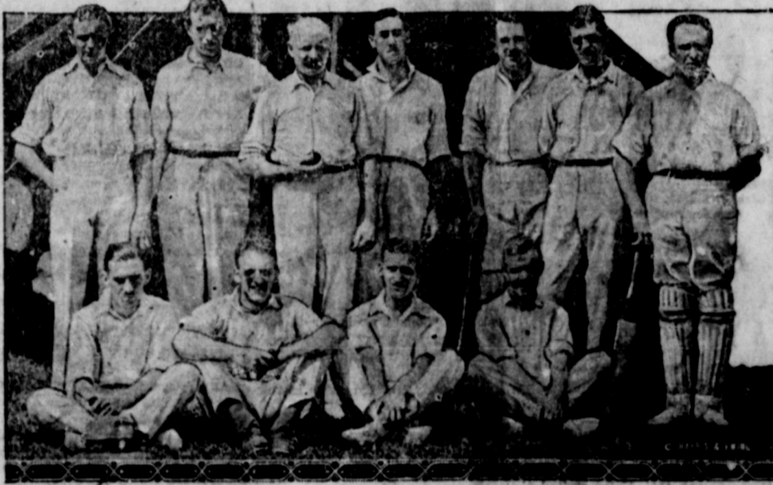
British sports have invaded Washington for the fall season. This picture, taken in Potomac park at the close of a day's game, shows the cricket team composed entirely of the British embassy staff.