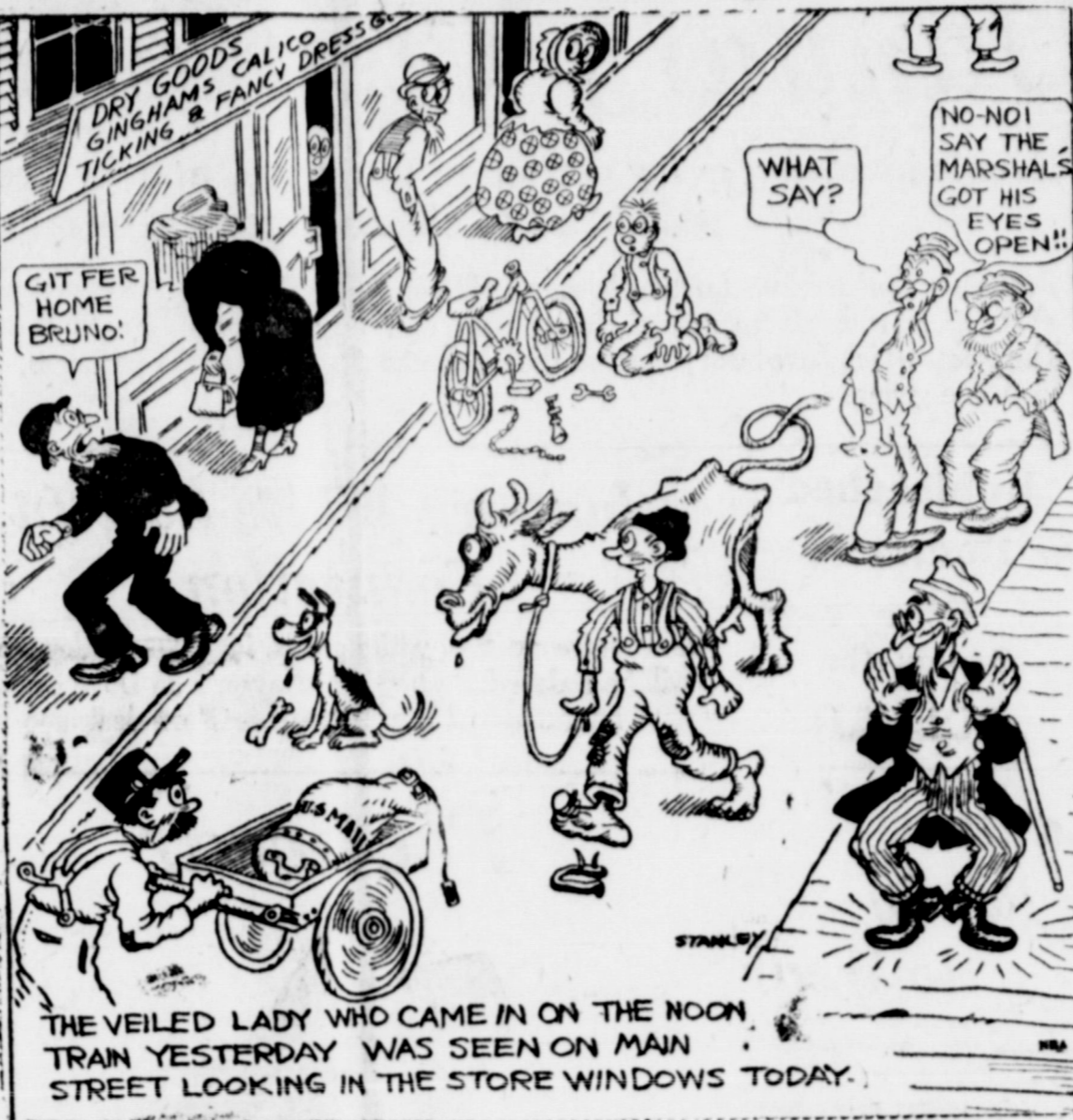
THE VEILED LADY WHO CAME IN ON THE NOON TRAIN YESTERDAY WAS SEEN ON MAIN STREET LOOKING IN THE STORE WINDOWS TODAY.

"Bell of Vernon" the flour that satisfies. White House Grocery. 17th-1f