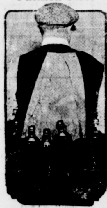
This natty coat is expected to make a broad appeal to the well-dressed man. Loose and flowing, materials predominate. Primarily a sport garment, it is now seen at some of the smartest evening gatherings.