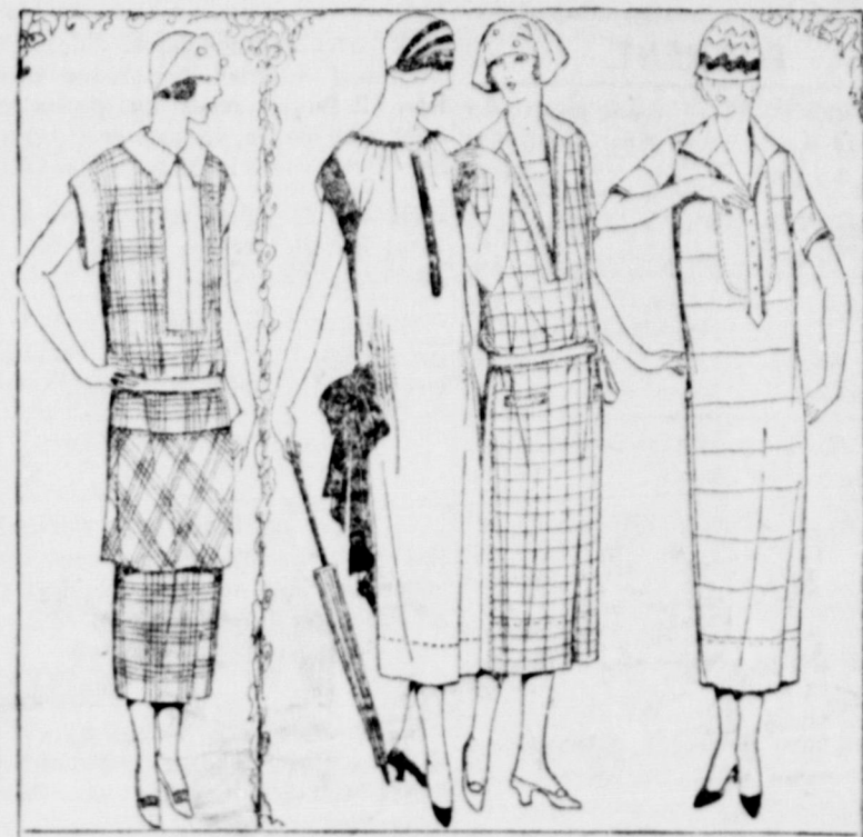
Dress 2113 40 cents Dress 2106 40 cents Dress 2107 45 cents Dress 2116 45 cents

Picture again the kind-hearted old man when he finally unrolled the