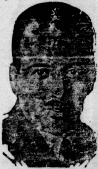
ALBERTO PANI Alberto J. Pani, Minister of Finance in President Obregon's Cabinet, has been officially designated as Mexican Ambassador to the United States, according to messages from Mexico City.