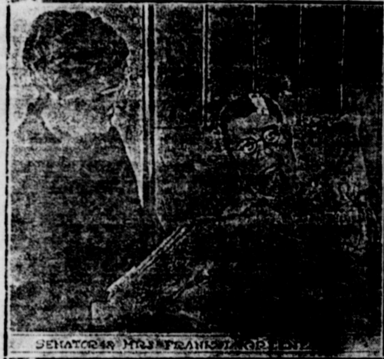
This is the first photograph to be made of U. S. Senator Frank L. Greene, now recovering in a Washington hospital from an almost fatal bullet wound, inflicted when he crossed the path of a revenue agent who was firing wildly at supposed bootleggers in Washington. The missile passed through his head. The photograph shows his wife reading to him the latest news of the day.