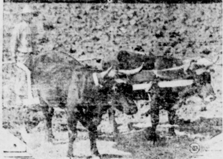
INDIANS IN MEXICO ARE SHIFTLSS. MAKING NO PROVISION FOR THEIR OLD AGE. BEGGARS (SKETCHED ABOVE) ARE EVERYWHERE. THE NATIVES ARE 200 YEARS BEHIND CIVILIZATION. THEY TAKE THEIR PRODUCTS TO MARKET ON BACKS OF BURROS (CENTER) AND PLOW WITH A FORKED STICK.