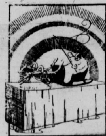
COOL & COMFORT IN THE KITCHEN