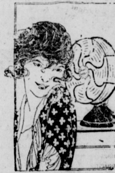
IF CHANGES PARTS!

For a Cool Home or Office Use Electricity