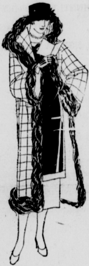
—All Collar and Cuff Sets Closed Out at Cost during our Anniversary Sale.