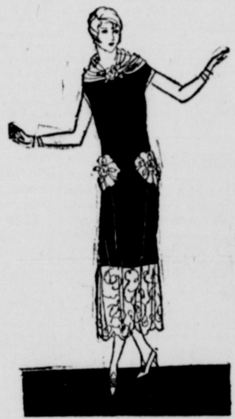
Phillipine Hand Made Underwear and Gowns $2 each during Anniversary Sale.