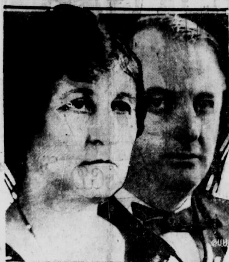
"MA" and "JIM"

Crawford had been denied bail by the District Court. The killing grew out of the contesting of Crawford's father's will.