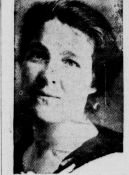
This is a new picture of Mrs. Corbett Ashby, English suffragist, who has been elected president of the International Suffrage Alliance in Rome, Italy.