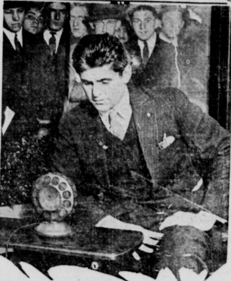
THIS shows the good Senor Firpo noted South American pugilist and fancy tumbler making his initial talk over the radio from a New York broadcasting station. The good senor's talk consisted mainly of grants and grows and to a 300 number of places was probably not taken for static.