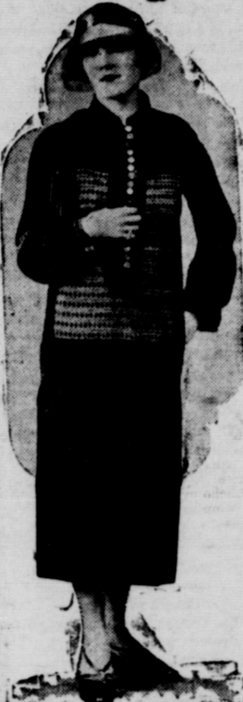
A TYPICAL Parisian street frock is this one of black velvet with red and gold embroidery and pearl buttons down the front. The simple turnover collar is the type that is particularly in demand and the sleeves show a new

of nice magazines were also sent to the library during that time.