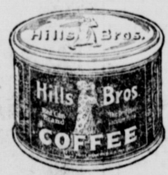
In the original Vacuum Pack which keeps the coffee fresh.

©1925, Hills Bros. THE H. O. WOOTEN GROCER CO., Sweetwater, Texas. Exclusive Wholesale Distributors