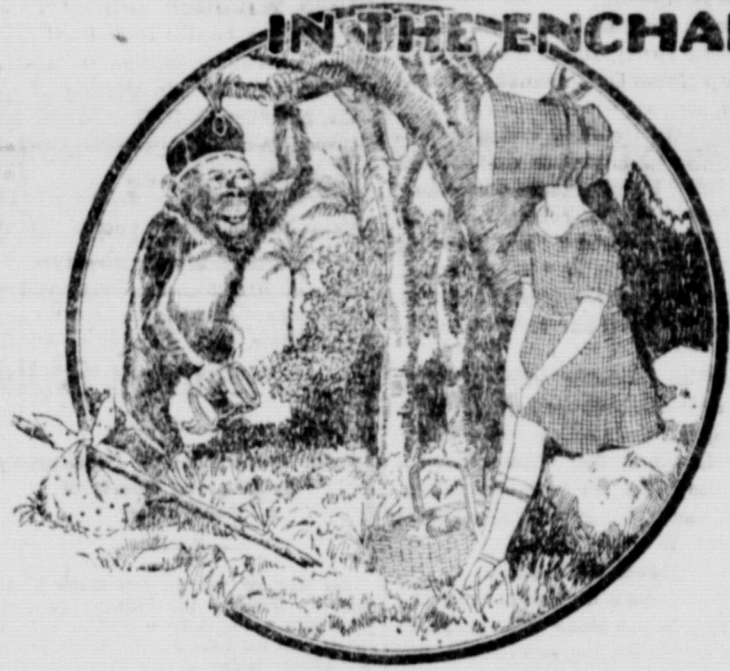
"I was hurrying back to our tree to see if my mother could get me some too."

MARY JANE'S MERRY JOURNEYS IN THE ENCHANTED FOREST What the Chim-pan-zee Said to Mary Jane This nice rich gingerbread, and this goodie-goodie fudge— Before Mary Jane could say "Boo" Jimmy the Chim-pan-zee gobbled up all the gingerbread and goodies and, grabbing up the can of MARY JANE SYRUP, started to run off with it. Mary Jane called him back and told him right out that he had eaten all her lunch and hadn't even said "Thank you." Jimmy was ashamed and said, "Oh! Mary Jane, please excuse me. I was hurrying back to our tree to see if my mother could get me some too." "That's all right, Jimmy, tell your mother to keep MARY JANE SYRUP always on hand, because it is good for you. She knows where to buy it, and she will like it as much as you do." WATCH FOR the next story about "What Mary Jane learned from the Mijangan Banjos." FREE For all children. The complete set of 20 NEW Mary Jane Fairy Tales, beautifully illustrated, sent free on receipt of one Mary Jane label taken from a can of Mary Jane Syrup. Write the Corn Products Refining Company, Dept. A, Argo, Ill.