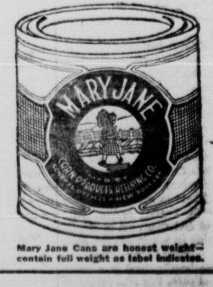
Mary Jane Cans are honest weight—contain full weight as label indicates.