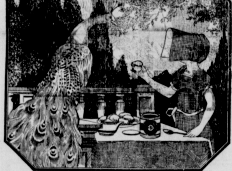
"And those who know me," said Mary Jane, "like to have me with them all the time."

IN one of the beautiful gardens of the Enchanted Forest, Mary Jane sat down to rest one afternoon near a lovely white marble summer house. While she was dreaming of all the good times she had had in the Enchanted Forest there stepped over the white railing of the summer house a glittering Pavo, the most splendid of birds, spreading his gorgeous tail and quivering his wings till the colors sparkled in the sunlight.