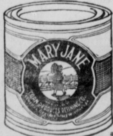
Mary Jane Cans are honest weight—contain full weight as label indicates.