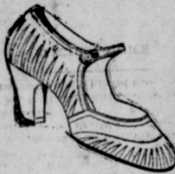
This number is very popular in either Black or Blonde Satin.

Enjoy a great musical treat at the Wright Hotel Friday evening, Public Library benefit, 75 cents adults and 50 cents children and school students. Buy your ticket early. 71-1td