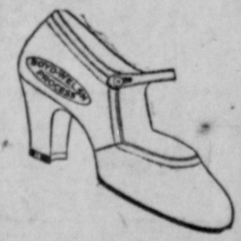
This number as illustrated above in White Kid.