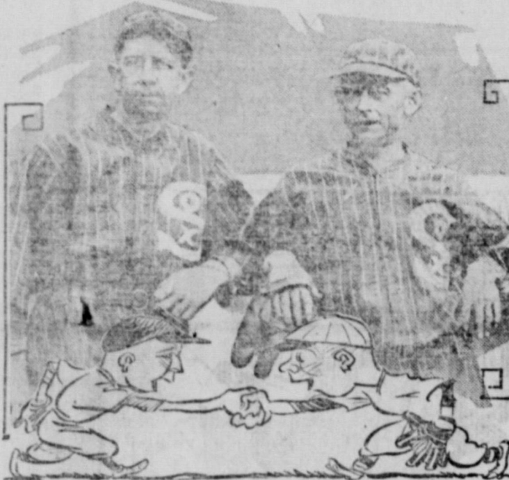
Presenting Eddie Collins, manager of the Chicago White Sox and Dickie Kerr, left-handed hurler, of the same team. Kerr recently returned to the fold, after an absence of a few seasons following a disagreement over salary matters. Kerr was one of the heroes of the 1919 world series. Collins expects him to turn in some good games for the Pale Hose during the remainder of the campaign. Kerr is depicted on the left in the above