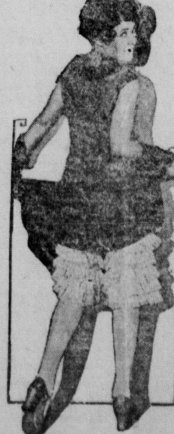
Pantaloons are just the thing for flappers now that the short skirts are to be even shorter, says Daily O'Neill of Hollywood.